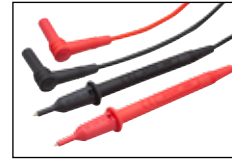
Premium silicone test leads included with both meters

TA10 ..... Protective case for DM9x and IM7x Series TA50 ..... Magnetic Hanging Strap TA60 ..... Thermocouple adapter and Type K probe TA70 ..... CAT IV Insulated Alligator Clips TA80 ..... CAT IV Silicone Test Leads