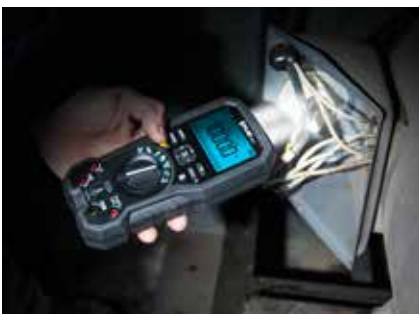
DM92 and DM93 feature powerful LED worklights