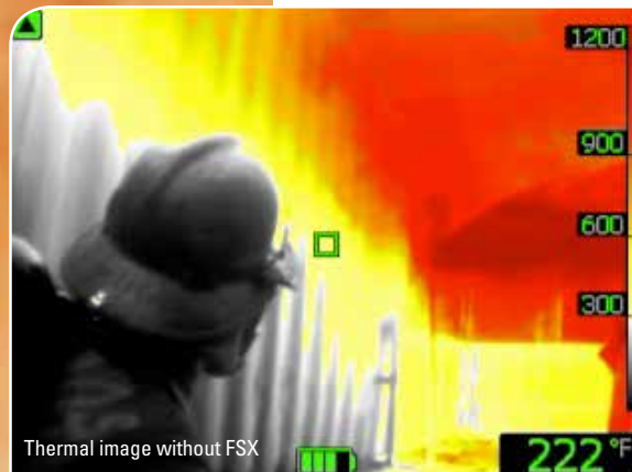
Thermal image without FSX