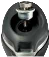
The FLIR K65 camera connectors (left) are fully sealed and the battery (right) can be fixed inside the camera with a screw.