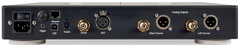
ABOVE: All digital inputs are supported here including wired Ethernet (as a DNLA compatible network player the M3 handles up to 384kHz PCM and DSD128 as DoP), USB-B (also 384kHz PCM and DSD128 as DoP), optical/coax S/PDIF and AES/EBU (XLR)

192kHz/24-bit download has the Scottish CO under François Leleux playing the Carmen Suite No 1 [CRD624] which is enjoyable. But the album also has Gounod's Petite Symphonie scored for winds only. The M3 conveyed very well the alertness of the playing and the intimacy that this group suggests.