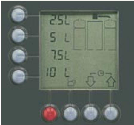
The convenient control panel with LCD display makes it easy to adjust and read settings.

Do you require large quantities of delicious fresh filter coffee, brewed quickly? Then Bravilor Bonamat's round filter machine is the solution. The range is ideal for busy periods where high volumes of coffee are demanded, such as theatre intervals or hospital canteens. The containers can be placed in almost any location with ease allowing coffee to be served at any moment wherever you wish. The machines come equipped with user friendly programming and in an attractive design: the robust stainless steel appearance confirming the quality of this equipment.