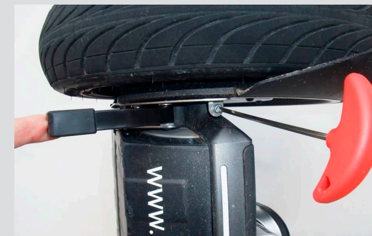
Apply pressure to parking leg while fixing front screw

Ensure that your SEGautostand still sits on top of the rubber pad (on top of the gearbox) and that it has not slipped to one side. Tighten both screws. Use the new coated screws only (with elastic stop material on the thread).