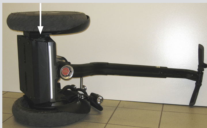
Lay your SEGWAY on its left side