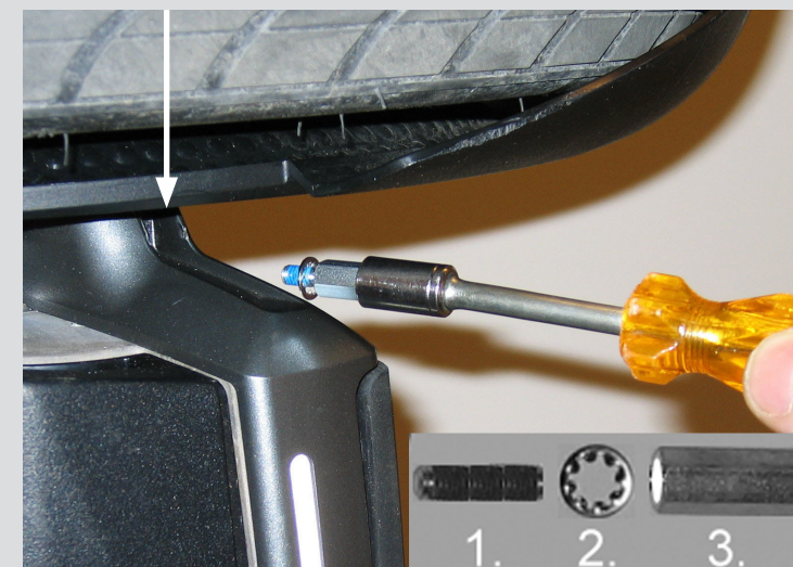
Fit rear screw of SEGautostand first