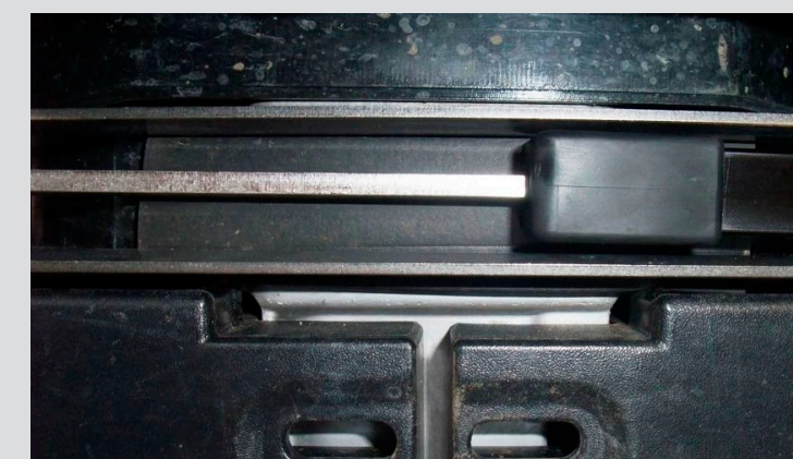
Ensure the SEGautostand rests completely on the rubber pad

Beware: The parking leg can fold in automatically, ensure your fingers do not get trapped!