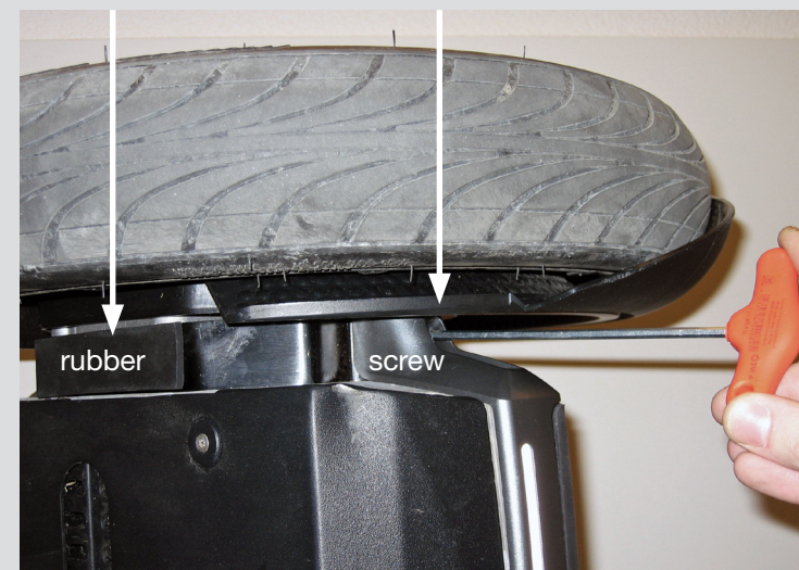
Fix rubber pad / remove screws